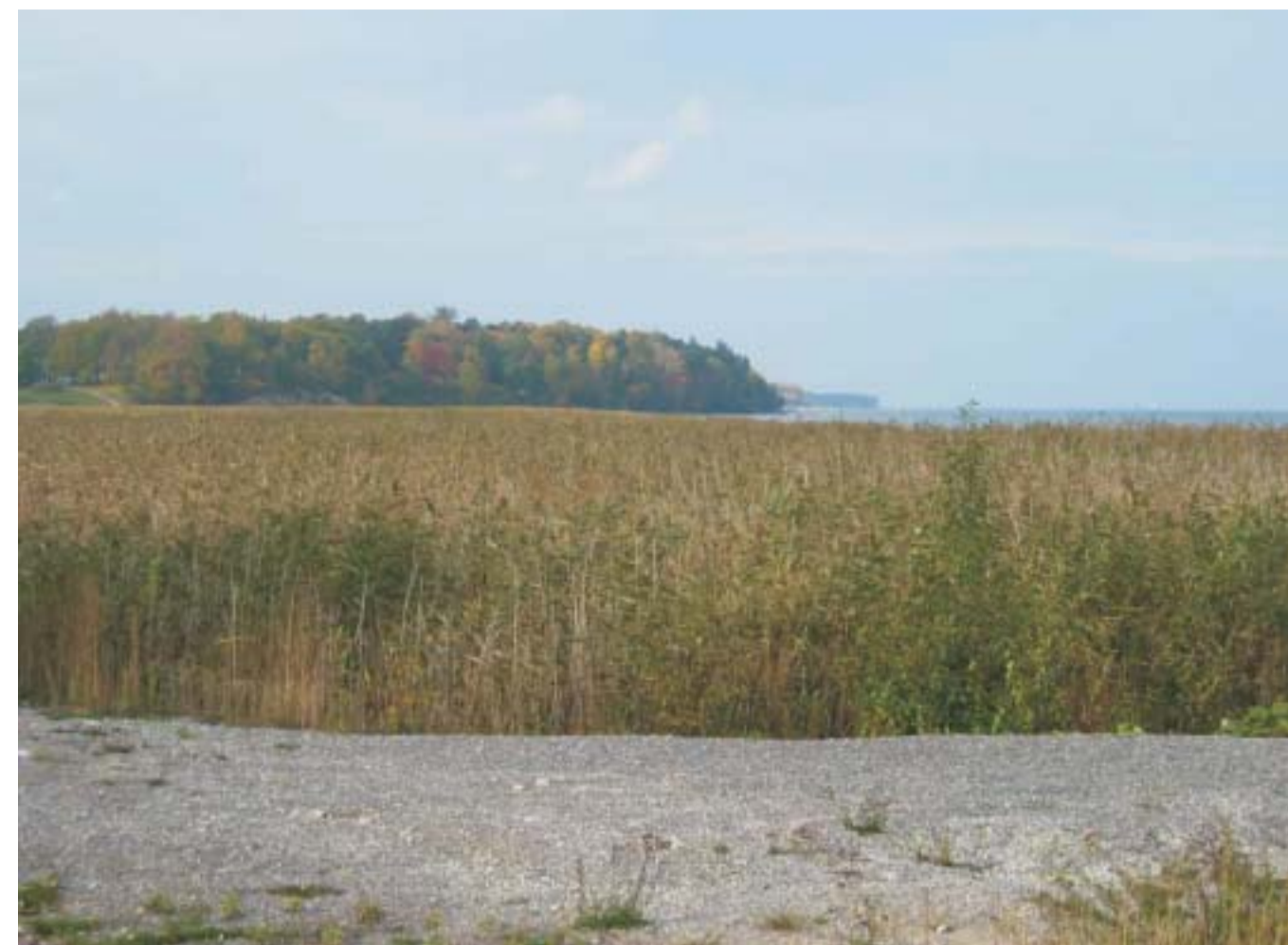
Figure 1. Reed bed