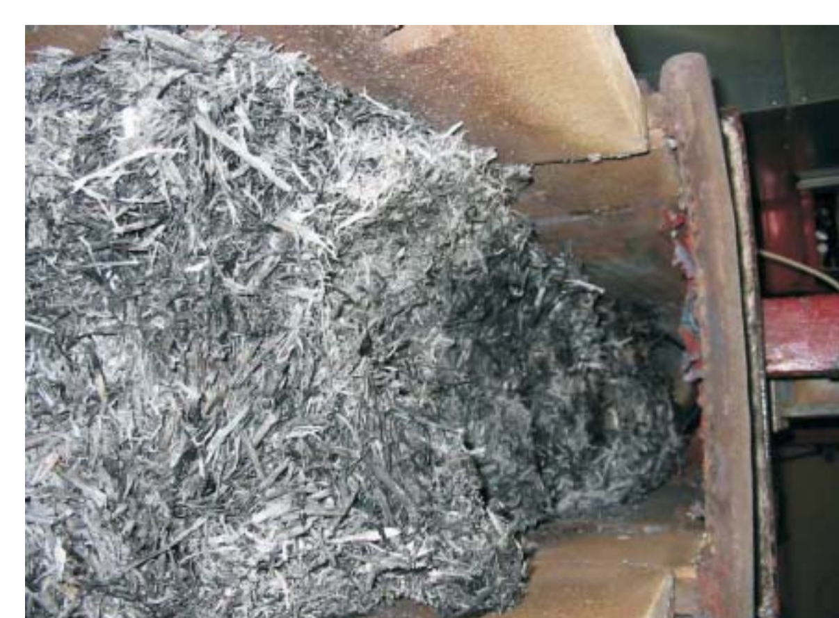
Figure 5. Ash

One possibility could be to refine the biomass through granulation or hydrolysis (result is ethanol) or pyrolysis and selling it to small consumers, to mainland or abroad.